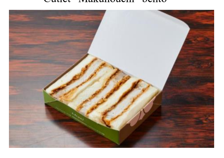
Pork cutlet sandwich