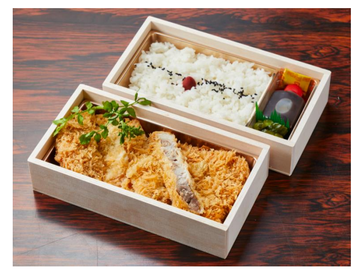
Pork cutlet bento