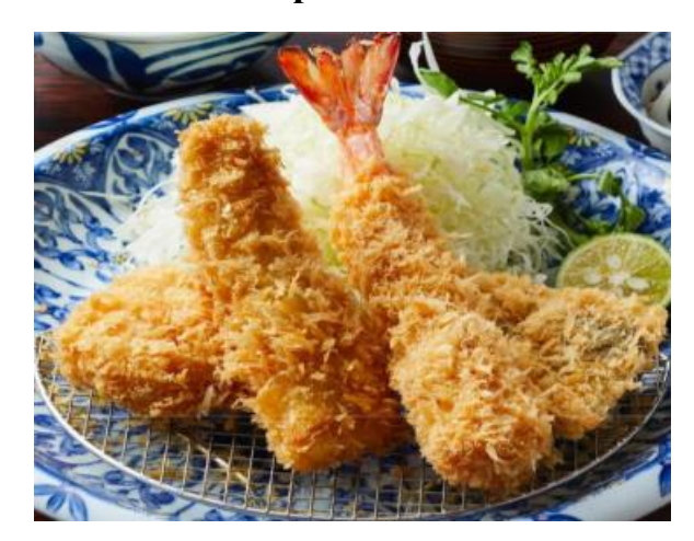
Assorted Seafood Fried