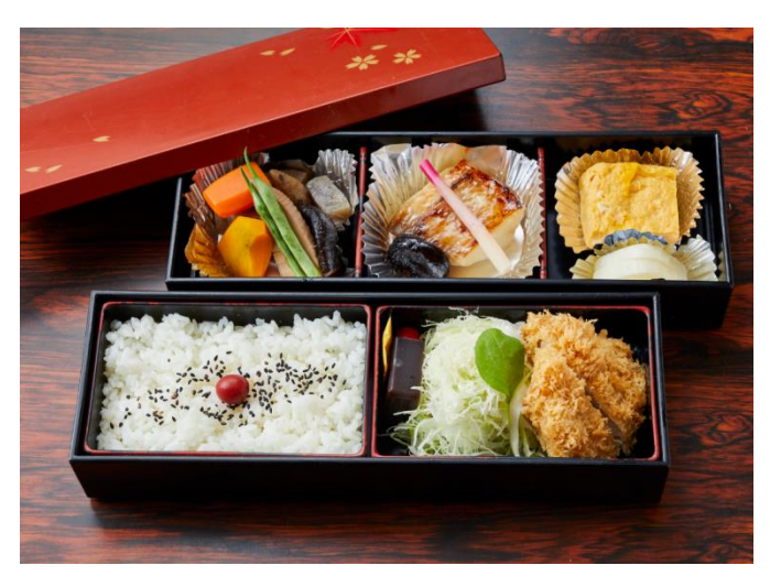
Cutlet "Makunouchi" bento