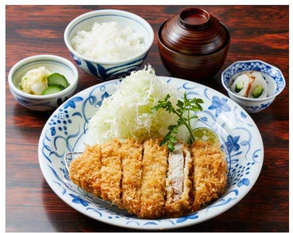
Pork loin cutlet