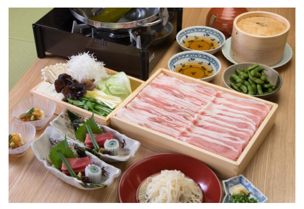
Pork "Shabu-shabu" hotpot