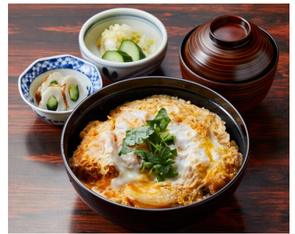
"Katsu don" pork cutlet rice bowl