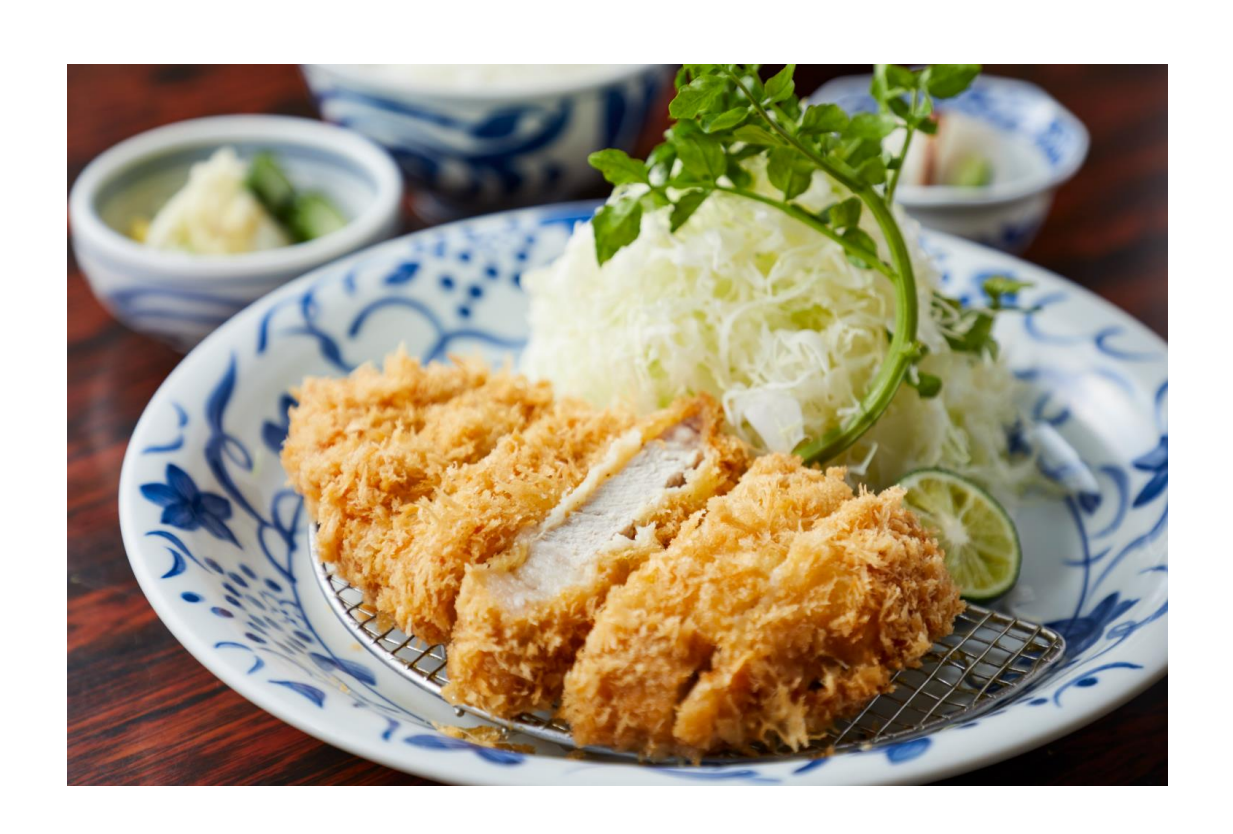
Tonkatsu Fumizen Franchise offer 2019