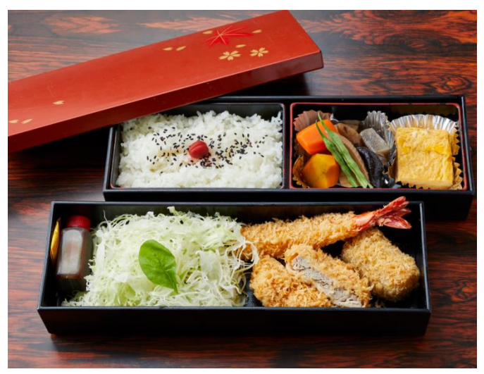
Pork cutlet and prawn cutlet bento