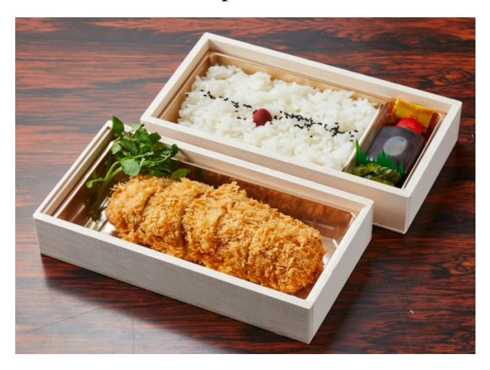
Pork cutlet bento